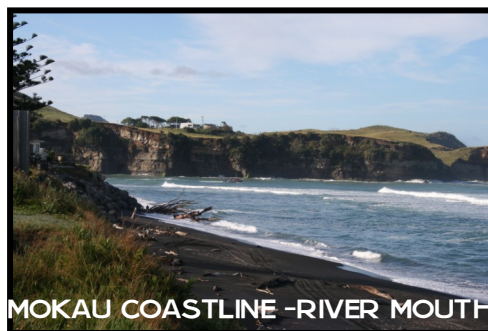
MOKAU COASTLINE -RIVER MOUTH